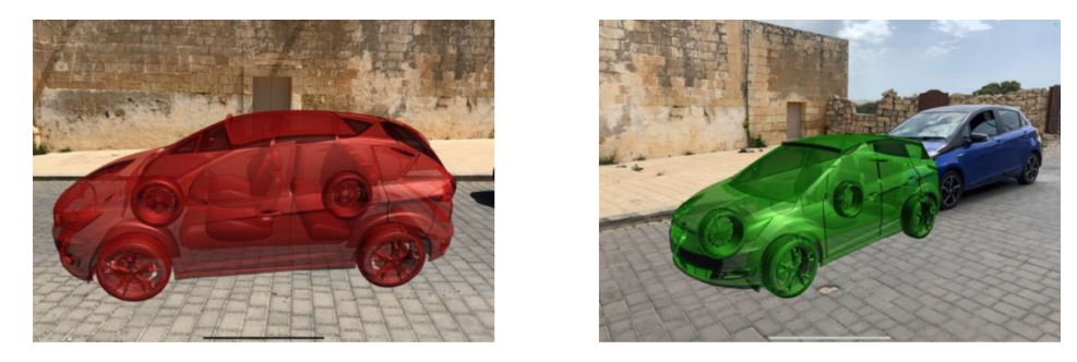
Figure 7: Concept 7. Left : non-yielding state with the red phantom car blocking the crossing area. Right : yielding state with the real car entering the green phantom car.

AutomotiveUI '21, September 09-14, 2021, Leeds, United Kingdom