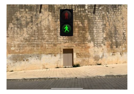
Figure 9: Concept 9. Left: non-yielding state with the red pedestrian icon. Right: yielding state with the green pedestrian icon.

head-locked text placement if the real-world task involves permanent visual monitoring in the central or near-peripheral visual field [26], which in our case would be monitoring of the vehicle. Moreover, the HUD was placed in the centre top section of the FOV since it is recommended to place text in top positions in complex environments that require constant monitoring [26]. Top positioning would also leave the bottom part of the FOV not occluded so that the pedestrian could still see where they are walking.