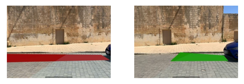
Figure 4: Concept 4. Left : non-yielding state with the red field of safe travel extending over the crossing area. Right : yielding state with the green field of travel shortened and truncating before the crossing area.

Figure 3: Concept 2. Left : non-yielding state with the red plane and hand icon augmented on the vehicle. Right : yielding state with the green plane and crossing figure icon augmented on the vehicle.