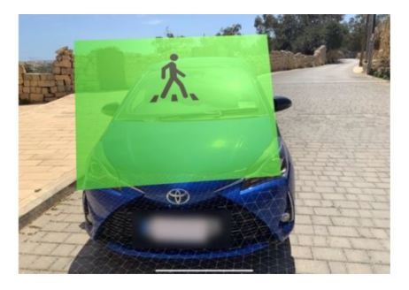
Figure 3: Concept 2. Left : non-yielding state with the red plane and hand icon augmented on the vehicle. Right : yielding state with the green plane and crossing figure icon augmented on the vehicle.