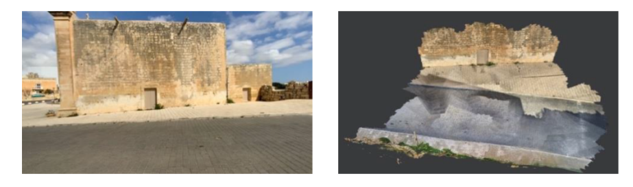
Figure 1: Left: The chosen unmarked crossing in Malta. Right: The captured LiDAR 3D scan on location.

representing different design elements were added to the board. The authors also used experience-based design to reach decisions. In total, the brainstorming was spread across three separate sessions for a total of 5 hours.