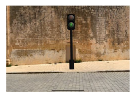
Figure 5: Concept 5. Left: non-yielding state with red pedestrian icon. Right: yielding state with green pedestrian icon.

field extends beyond the crossing point, whereas for the yielding state, the field switches to green, widens, and terminates prior to the point of crossing to emphasize the vehicle will not cross beyond this point.