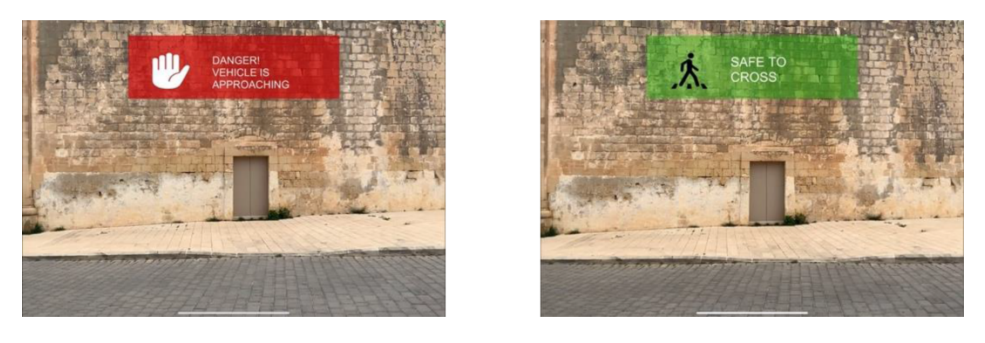
Figure 8: Concept 8. Left : the non-yielding state with the red HUD showing the hand icon and corresponding text message. Right : the yielding state with the green HUD, walking pedestrian icon, and corresponding text message.

Figure 7: Concept 7. Left : non-yielding state with the red phantom car blocking the crossing area. Right : yielding state with the real car entering the green phantom car.